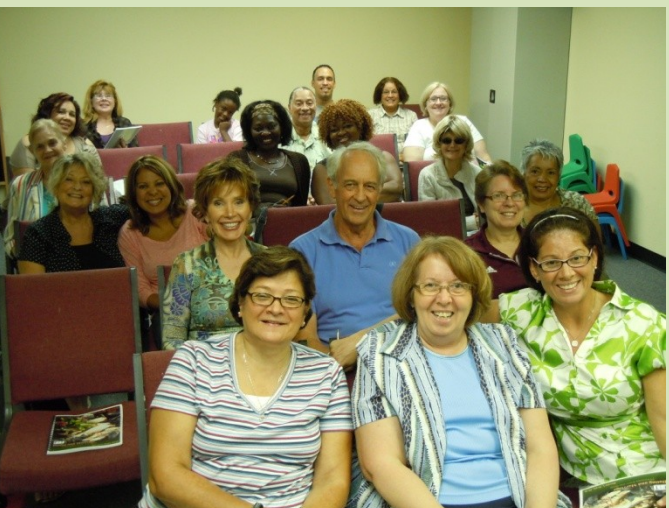
OCTOBER 22 – BRADENTON, FL – 8 NEW, 2 RECERTIFIED